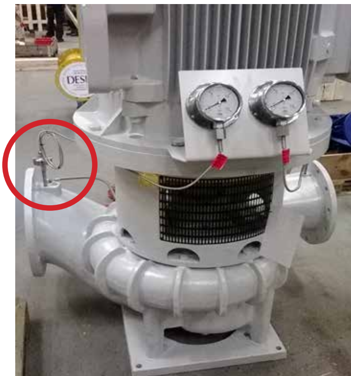
Super Duplex NSL stainless steel pump for aggressive fluids.

All pump sizes are available as self-priming pumps by means of a separate built-on air-operated ejector priming unit or built-on priming pump, and can be delivered with high-efficient motors and frequency converters for efficient performance etc.